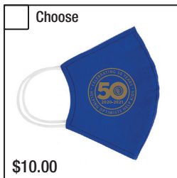
50th Anniversary Face Mask