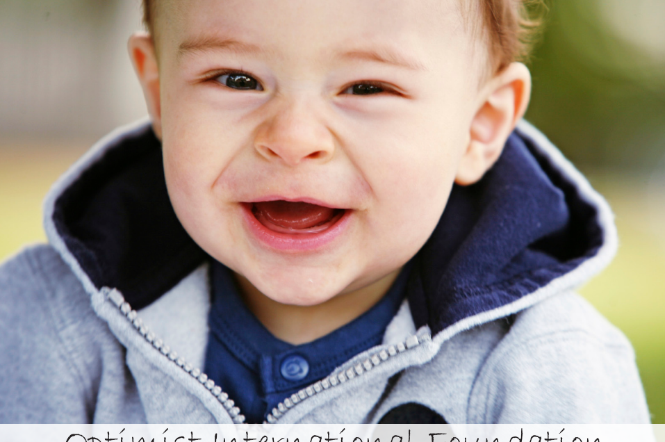
Optimist International Foundation Donor's Guide to Giving